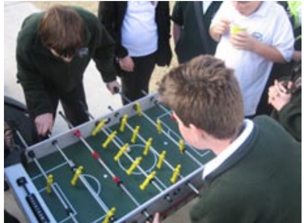
The roar of the crowd, the sound of turning steel, the thud of the ball as it hits the goal. It's the magic of fussball. Don't miss out. Every lunchtime outside the library. Be there.