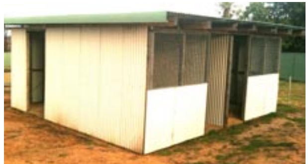
The Chicken Palace

Junior Agriculture students in conjunction with Bathurst High's live stock are starting an incubation program with a variety of different poultry. By the next newsletter we should have a dozen baby chickens.