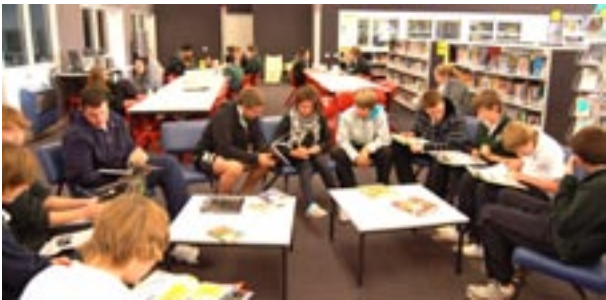
Year 9 Library lesson