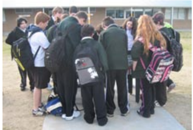
When you see a crowd gather you know why.