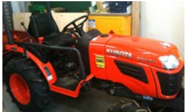
The Agriculture tractor

The school is calling for nominations from Year 11 students to stand for the Student Leadership Team and the School Captains for 2011. Students who would like to nominate themselves for this role in the school needs to prepare a resume of their academic, sporting and citizenship achievement during their school career. They can also include any relevant experience or activities they have done in the wider community in their resume. They need to find referees to support their application. Students need to start preparing their applications.