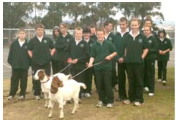
Year 7 with 'Burger' and 'Mince'