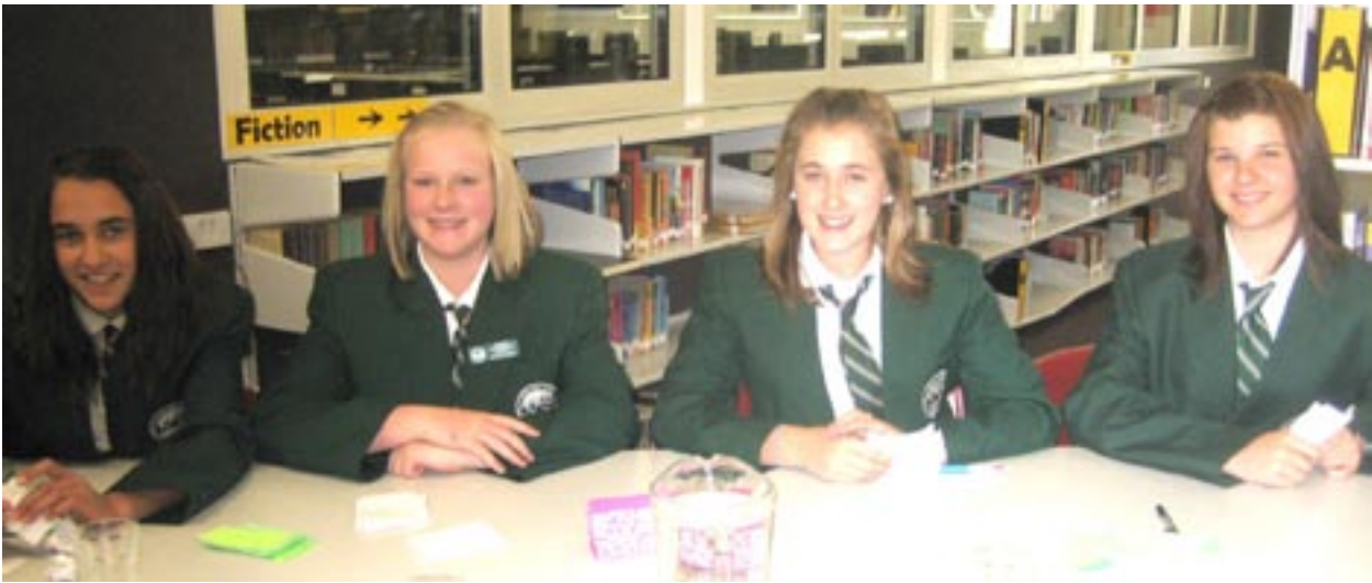
The victorious Kelso Year 7 Girls' Debating team