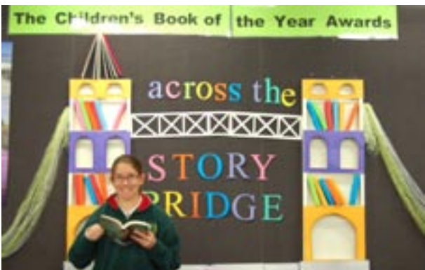
The slogan for this year's Book Week is 'Across the story bridge'.

Give your child a head start in life with J4K (Jujutsu 4 Kids)