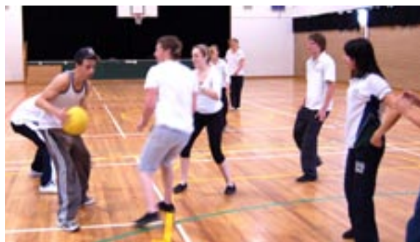
Year 11 Basketball