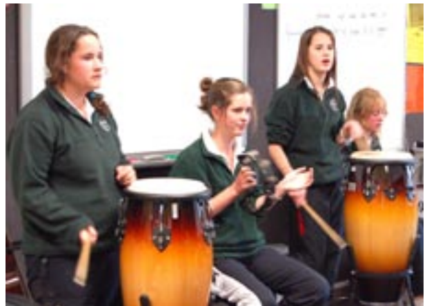
'One, two, three, four...'