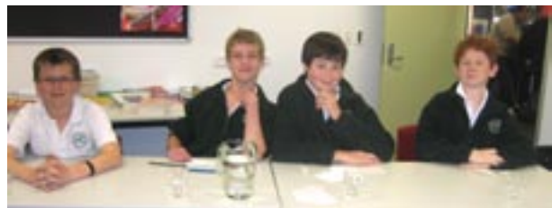
The Kelso Boys' Debating team

The Visual Arts department would like to thank Masterfoods for supplying them with a stack of cardboard. Keep an eye out for some amazing sculptures in the future.