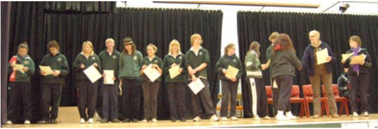
The presentation of History and Geography awards on assembly