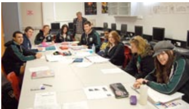
Year 12 Physics