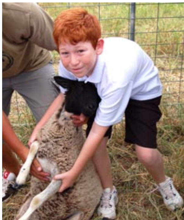
Year 7 Agriculture

The program will continue in Weeks 6 and 7 and later in Terms 2, 3 and 4.