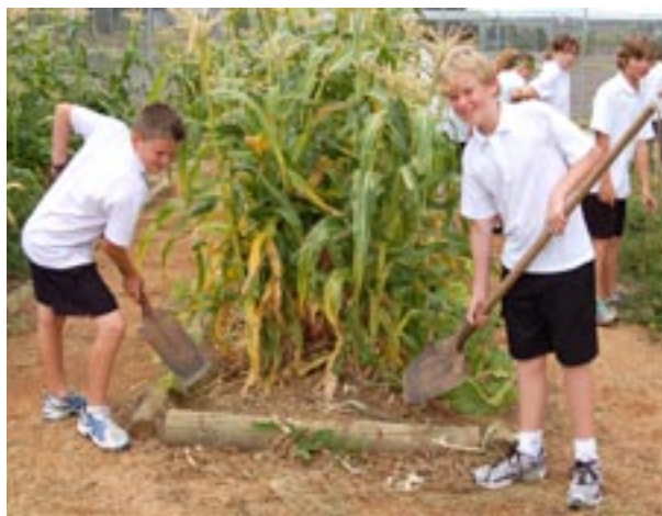
The corn crop

We are leaving the warm weather and have made some money from our crops. We have successfully harvested tomatoes, carrots, butternut pumpkins, rock melons and sweet corn. Now it is time to prepare for the cabbage and Brussel sprouts season.