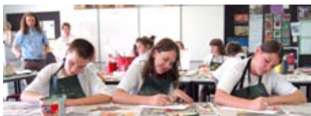
Year 7 Art