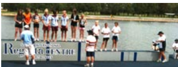
Presentation of medals ceremony at Penrith Lakes

Well done to everybody for doing so well.