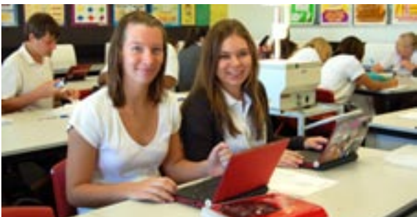
Year 10 students using laptops