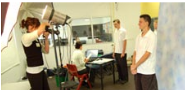
School photos were taken on the 2nd March

The next round will be held before the 26th March.