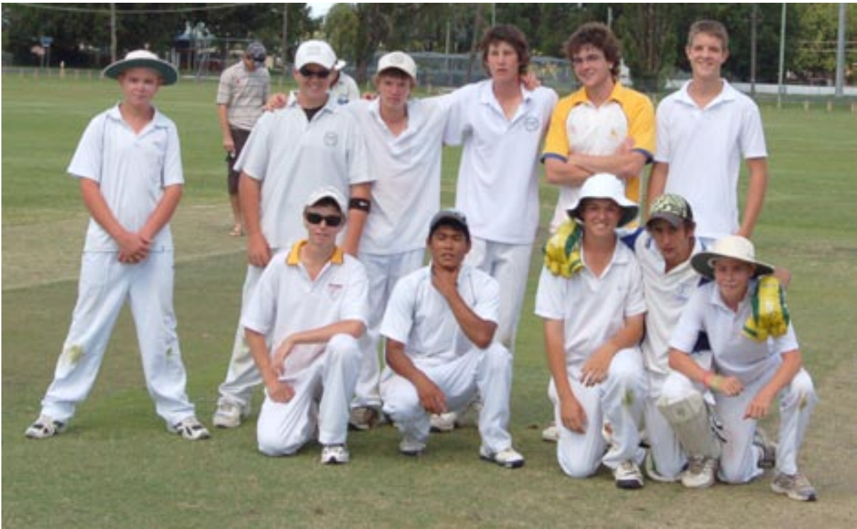
The Kelso High Open Boys' Cricket team