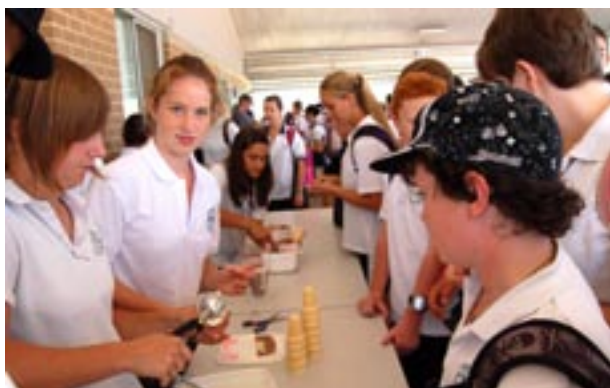
Serving ice cream