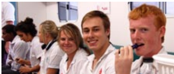
Waiting to give blood

On Tuesday 23rd February we sold ice creams for $1 at lunchtime. It was very successful thanks to the weather and the support of Kelso High students. We raised over $100. A big thankyou goes to the P&C who supplied the ice cream and to our ice cream sellers.