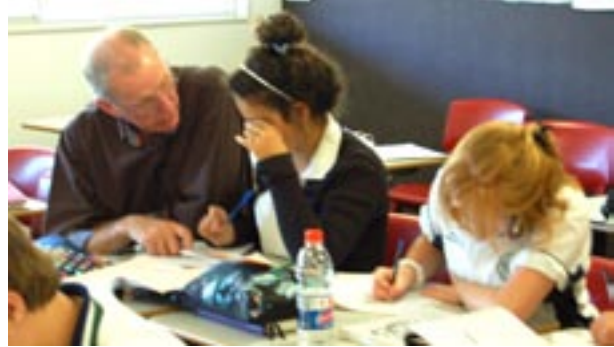
Year 11 Maths