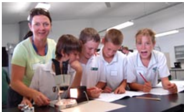
iLearn using microscopes in Science